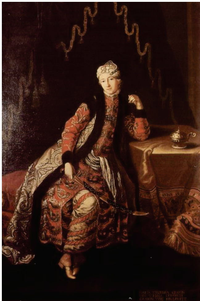
Fig. 2. Portrait of Jean Baptiste-Tavernier (1605-1689) by Nicolas de Largillière.

advised him not to take up the journey, but he risked his life to see the diamond mines, wanted to be the first European ‘to open the route for the Franks’, (Frank is the distorted form of Firaungi, the local term for the Europeans). He has mentioned that about 60,000 workers were employed in the diamond industry of South India.